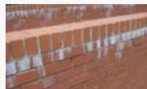
Lime stains emanating from mortar. No damp proof membrane has been incorporated under the brick edge capping.

A strong mortar mix is necessary for the durability of the brickwork. Do not recess mortar joints. Consider whether brickwork will be adjacent roadways where de-icing salts will regularly be used.