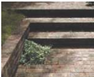
Chailey Multi Stock Paver Henley-on-Thames