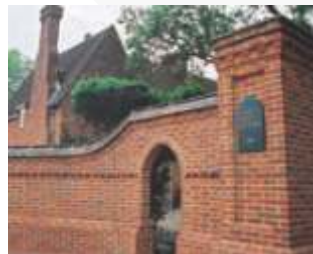
Swanage Handmade Multi Milton Keynes